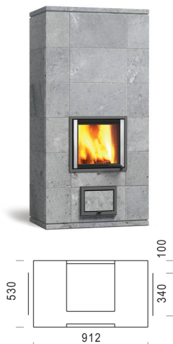
HESTIA SOLO 180