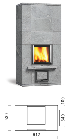
HESTIA SOLO 180-1